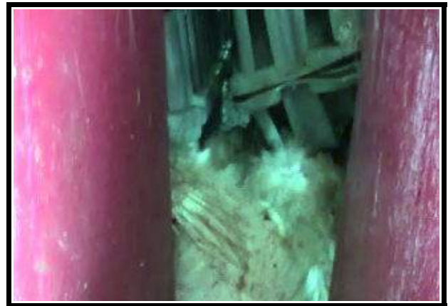
Photo taken in Quebec Birds suffocated to death in trailer accident

In fact, investigations in Canada have recorded instances of bird deaths due to crushing from these poorly constructed crates. Truck drivers frequently do not install the metal columns between the rows of crates. As a result, if the driver applies the brakes too quickly, entire columns of crates fall into the gap. The tops of the crates fly open and birds are spilled onto busy roadways and struck by cars. Other birds cling to the sides of crates or fall into the cracks between crates, and become inaccessible and suffocate to death.