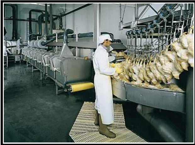
Dead birds, exiting chambers, are then hung