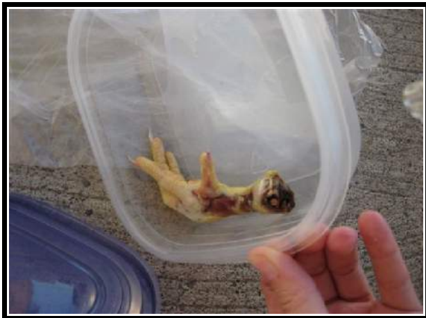
Retrieved chicken foot that was trapped in a transport crate

Another torn off chicken foot left in just-washed trailer